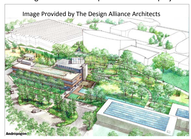
Figure 1 - Bird's eye perspective of the Phipps Conservatory and Center for Sustainable Landscapes.

The Center for Sustainable Landscapes will be a showcase for new sustainable construction materials and techniques. Some of the sustainable features include: a green roof, passive and active HVAC systems, onsite power generation, onsite gray and black water retention, a building automation system for the control of dynamic building elements and power consumption, and a intensive effort on using locally available new and reclaimed building materials. Due to the heavy emphasis on sustainability, significant increases in upfront construction costs were seen in exchange for lower life-cycle and operation costs. Figure 2, shows the passive flow of air through the atrium.