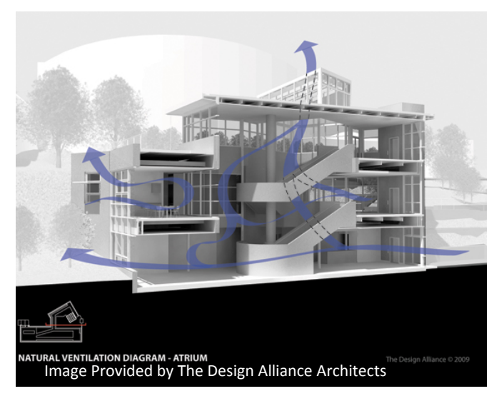
Figure 2 – Building section explaining the natural ventilation of the passively designed atrium.