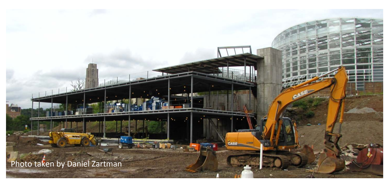
Figure 3 - Concrete and steel superstructure taken September 7, 2011.

Aside from weather, there are few externalities affecting work on this project. Site access and size are suitable for the scale of the building footprint and project. The site that the project inhabits was almost vacant, and thus no phased or dual occupancy requirements are needed. Minor inconveniences include the relocation of a few select utilities and the demolition of a small portion of an existing small onsite warehouse.